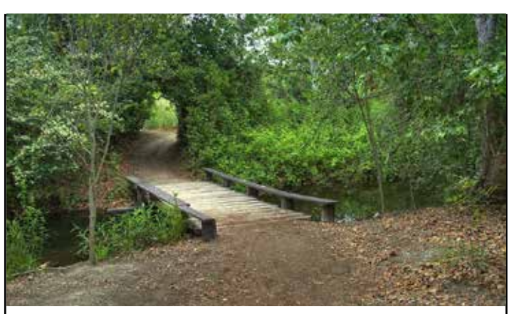
SHABBAT MIDBAR at Cl Dorado Nature Center

Please share your thoughts with me on this or other issues at VPRitualPractices@tilb.org