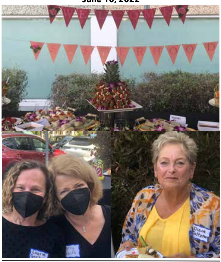
SISTERHOOD BOARD INSTALLATION June 13, 2022