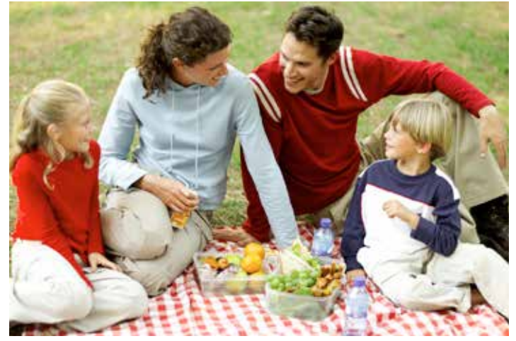
SHABBAT IN THE PARK Friday, July 9 at 6:00 pm (Park information to follow)